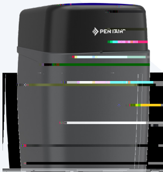
50-gallon atmospheric tank

*Not performance tested or certified by NSF.