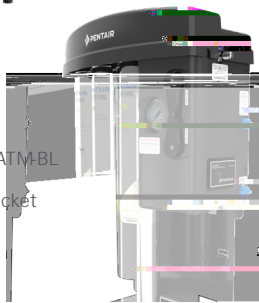
EZ-RO 650/50ATM-BL four stand bracket