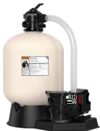
Sand Dollar Filter System 2

Our blow-molded process creates a one piece, non-corrosive tank of outstanding strength